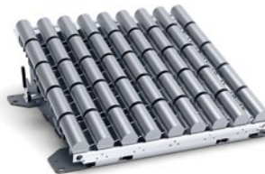
Shaft parts tray